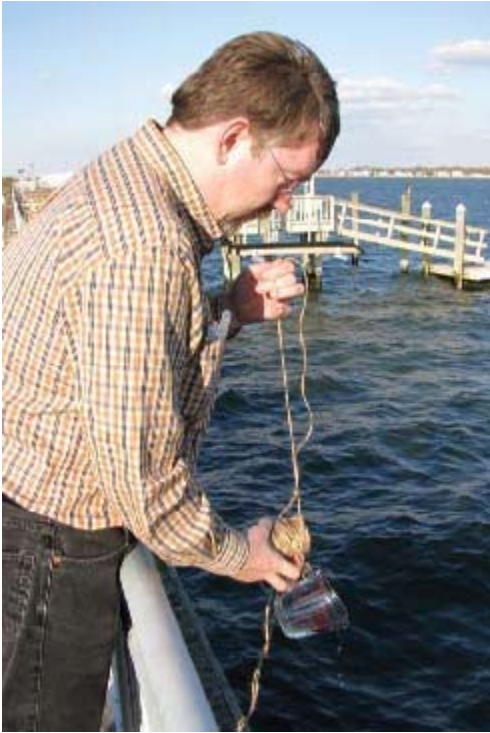
Polle uses a homespun apparatus to sample algae rich waters near Brooklyn.

economy. (Still, he's a little reluctant to call himself an algae hunter. "If you want to put it in two words, then yes," he says.)