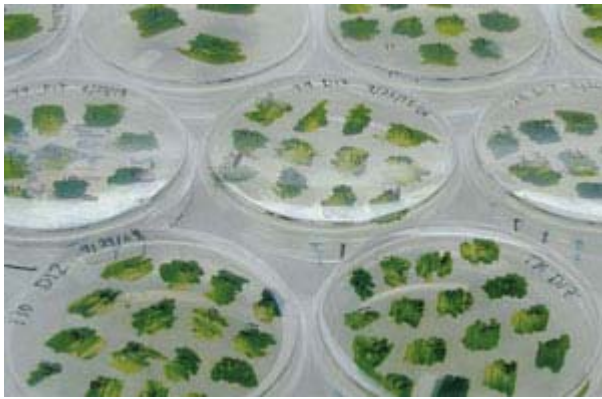
Algae samples await testing in Solazyme's lab.

For a biofuel company to make serious headway in the US fuel market, it must prove that it can produce at least one million gallons of fuel per day, according to Straser. And accomplishing that, he says, takes some major machinery. "You're going to need [closed-tank bioreactors] the size of a football stadium." And biofuel efforts based on open-pond growth of photosynthetic algae, which gather at the surface to draw energy from sunlight, might need considerably more space.