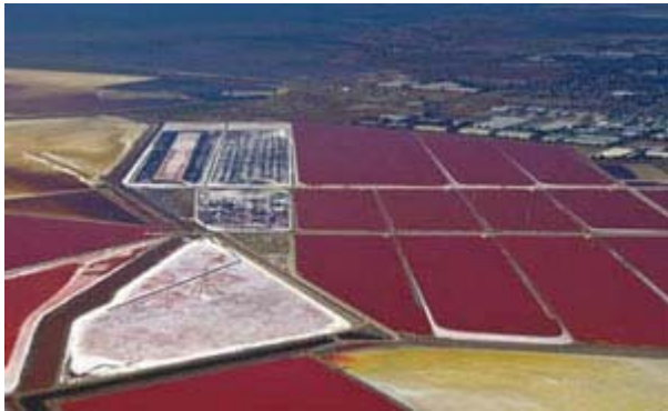
Cargill's evaporation ponds concentrate salt and algae.