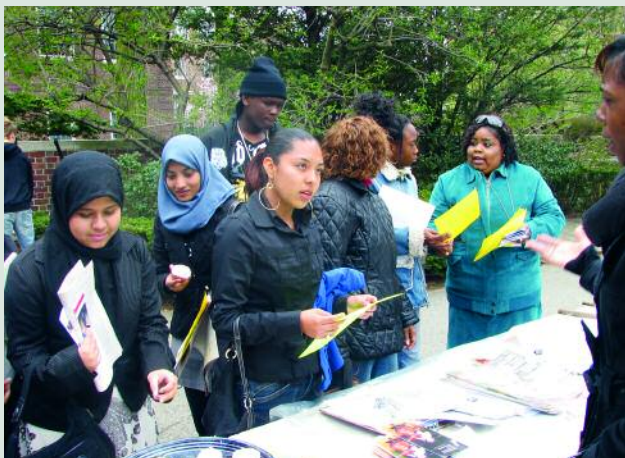
Brooklyn College Open House, April 2008. Student volunteers discuss the Children's Studies program with prospective students.