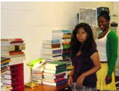
Summer Youth Employment Project

This past academic year, two new internship sites were added—a not-