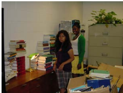
Summer Youth Employment high school students learning while earning

In addition to ongoing individual research projects that students undertake for independent study, grant work, or the CS21 Applied Research in Children's Studies course, the Children's Studies Center welcomed summer youth employees from nearby high schools in the summer of 2009. They were given an overview of the UNCRC, along with the background information on the Children's Studies Center and Program. Three students worked diligently to help list the numerous documents, publications, and books that we received from the Cynthia Price Cohen library. These documents will be an invaluable tool for future research by our students. Summer