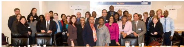
Meeting of Juvenile Justice Minds Participants with Senator Velmanette Montgomery

In August 2009, the U.S. Department of Justice (USDOJ) released a report of the findings of a two-year investigation of four secure juvenile detention facilities in New York—Lansing, Gossett, Tryon Boys, and Tryon Girls. The findings included many instances of violation of constitutional standards in the area of protection from harm and mental health care. The report detailed excessive use of force and inappropriate restraints by staff against youth resulting in numerous instances of severe physical injuries, inappropriate medication practices regarding psychotropic medications, inadequate investigations or actions to address abuses by staff against youth, and inadequate care and treatment of youth, especially those requiring mental health care or substance abuse treatment. The USDOJ required the NYS Office of Children and Family Services (OCFS) to reach a resolution addressing their concerns within forty-nine days of the report or they would authorize the Attorney General to initiate a lawsuit against them.