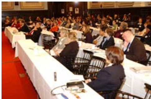
Children and the Law in New York Policy Symposium Attendees

March 11, 2004, Association of the Bar of the City of New York