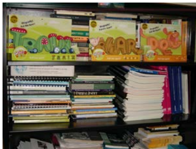
Word World Prototypes

The U.S. Department of Education Ready to Learn Partnership was established to support research studies evaluating the effectiveness of newly developed and innovative early literacy materials, media products, and platforms created for children, parents, educators, early childhood caregivers, and service providers. The research aims to increase literacy skills in children aged two to eight. A particular focus of the research is to help children from economically disadvantaged backgrounds get a strong start as they enter school and to empower them to become lifelong learners with better chances to succeed.