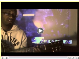
Global Lullaby Project

Through the Children and Youth Studies Global Lullaby Project we are creating a collection of children's songs reflecting the diverse student body at Brooklyn College.