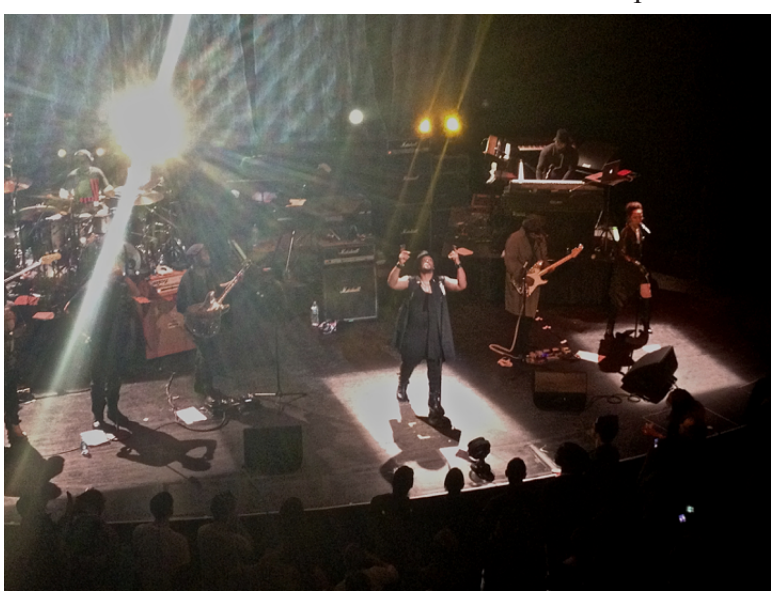
D'Angelo and the Vanguard perform at the Apollo Theatre, 7 February 2015.

sparse three-chord chromatic riff reminiscent of Lou Donaldson's soul jazz recording of "It's Your Thing" (Blue Note, 1969), D'Angelo unites hip hop, a relatively recent genre, with one of the earliest African American musical traditions. In live performance, this song takes on additional layers of historical significance, as D'Angelo extends it into a funk jam session, referencing the bandleading techniques made famous by