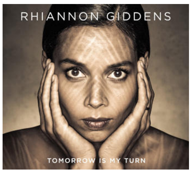
Tomorrow is My Turn Album by Rhiannon Giddens

Rhiannon Giddens' solo debut, Tomorrow is My Turn , is not only a brilliant expression of musicianship and a Billboard chart-topping album, but it is also an incisive folk narrative and survey of influential women in American music. With Tomorrow is My Turn , Giddens continues the important work she began with The Carolina Chocolate Drops¹, re-envisioning gems of the past in a new context and for a new audience. The Chocolate Drops, an African American string band dedicated to rediscovering, reinterpreting, and reinvigorating string band music for a new generation, were initially inspired by visiting with and learning from the style of old-time North Carolina fiddler, Joe Thompson. Their 2010 album, Genuine Negro Jig , earned a Grammy for Best Traditional Folk Album.