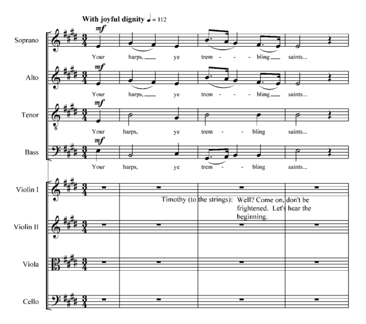
Figure 2. Parker, Singers Glen, Act 2, Scene 2, Mount Ephraim, mm. 1-3 Used by permission of Hinshaw Music, Inc.

With Timothy encouraging the instrumentalists to join in, the young people begin to sing "Mt. Ephraim." The text of the hymn itself advocates the use of instruments, as well as underscoring the nervousness of the musicians, beginning with the lines "Your harps, ye trembling saints, Down from the willows take" (Figure 2).