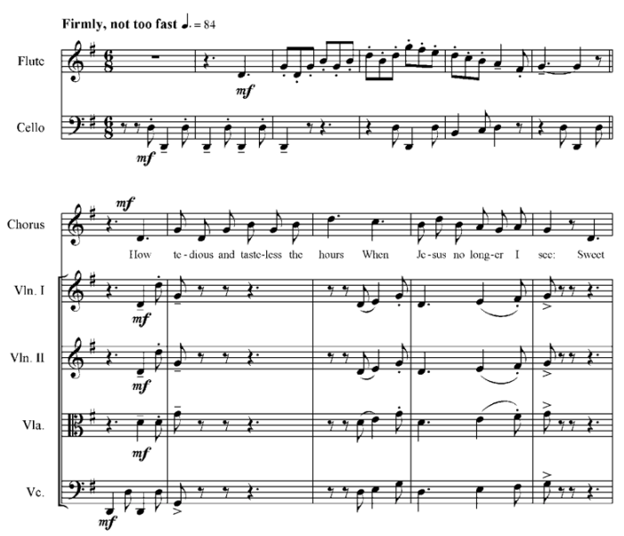
Figure 4. Parker, Singers Glen, Act 2, Scene 2, Greenfields, mm. 1-11 Used by permission of Hinshaw Music, Inc.

The tension in the act increases with the next hymn, "Greenwood," during which the children start moving to the music. Not only is it a singing and playing school, it now begins to transform itself into a barn dance as well. Hannah chides the children for their levity. Someone calls for a cheerful hymn, and as "Greenfields" begins, more and more people begin dancing. Parker highlights the dance qualities of this hymn through accents on the strong beats and light staccato notes on the weak beats in the instrumental parts (Figure 4).