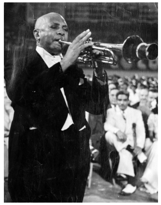
W.C. Handy at the American Negro Music Festival

The functions of public musical spectacle in 1940s Chicago were bound up with a polyphony of stark and sometimes contradictory changes. Chicago's predominantly African American South Side had become more settled as participants in the first waves of the Great Migration established firm roots, even as the city's "Black Belt" was newly transformed by fresh arrivals that ballooned Chicago's black population by 77% between 1940 and 1950. Meanwhile, over the course of the decade, African Americans remained attentive to a dramatic narrowing of the political spectrum, from accommodation of a populist, patriotic progressivism to one dominated by virulent Cold War anticommunism. Sponsored by the Chicago Defender , arguably the country's flagship black newspaper, and for a brief time the premiere black-organized event in the country, the American Negro Music Festival (ANMF) was through its ten years of existence responsive to many of the communal, civic, and national developments during this transitional decade. In seeking to showcase both racial achievement and interracial harmony, festival organizers registered ambivalently embraced shifts in black cultural identity during and in the years following World War II, as well as the possibilities and limits of coalition politics.