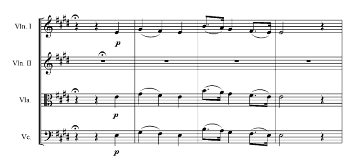
Figure 3. Parker, Singers Glen, Act 2, Scene 2, Mount Ephraim, mm. 4-7 Used by permission of Hinshaw Music, Inc.

The instrumentalists hesitantly (perhaps even guiltily?) follow the voices before joining together with them. They quietly echo the melody just sung (Figure 3).