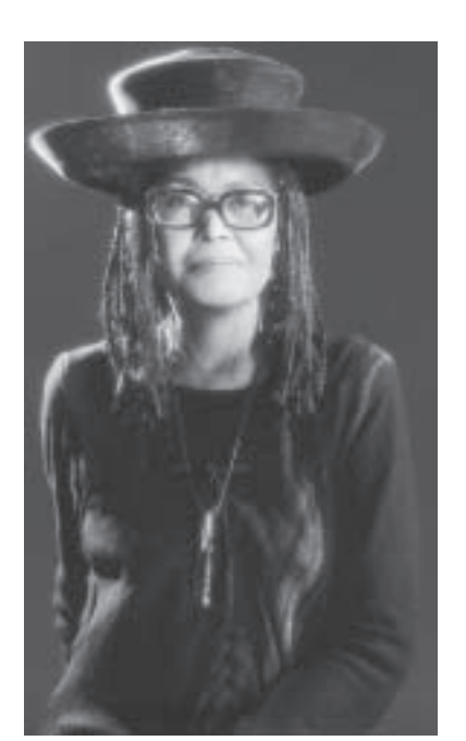
Abbey Lincoln