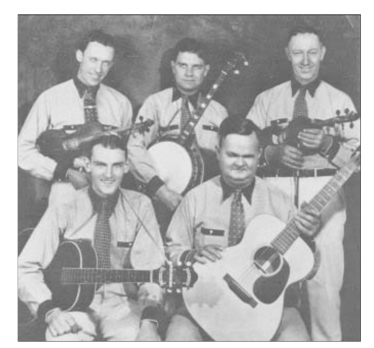
Riley Puckett (seated, right) and string band

In order to help publicize the collection and its value as a resource for music research, the JEMF began publishing a mimeographed newsletter about its activities in October 1965. As the JEMF Newsletter grew in scope and substance, it morphed into a full-length journal, the JEMF Quarterly, in 1969. It then contained major articles about veteran musicians, occasional song studies, discographies, bibliographies book reviews, and correspondence. The journal was pub-