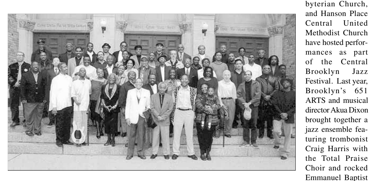
A Great Day in Brooklyn (organized by Ahmed Abdullah and Bob Myers)

The jazz revolution in Brooklyn has not led to a distinctive "Brooklyn aesthetic," largely because virtually all genres are represented-from bebop avant-garde. to Nevertheless, some general characteristics of the music and artists deserve comment.