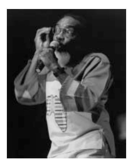
Hollis "Chalkdust" Liverpool

The online and traveling exhibitions are organized by the Historical Museum of Southern Florida.