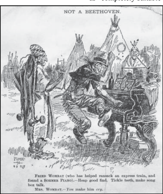
Figure 3 Advertising Card, Behr Piano Co., 1893.

and of all ages." The piano had become for Americans, in the words of historian Cynthia Adams Hoover, "more than a household object. It took on the aura of an icon, an altar to respectability and culture, a treasured possession that was given a place of honor in the parlor—the Victorian era's domestic chapel. The acquisition of such an important household necessity was not to be taken lightly, and most piano manufacturers promoted their instruments as symbols of a morally superior lifestyle." Hoover assumes the parlor to be a separate sphere; what I mean to show is how "the Victorian era's domestic chapel" was intimately tied to colonialism. As Figure 3 demonstrates, pianos were not for everyone. This cheeky advertisement depicts a stereotyped Native American wildly banging his fists on a Sohmer piano acquired in a recent train heist. The image displays what Amy Kaplan calls "the imperial reach of domesticity and its relation to the foreign."9