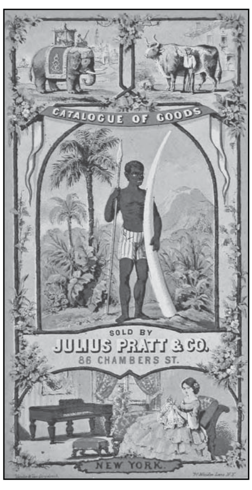
Figure 1. Ivory Goods Catalog Cover, circa 1865. Pratt-Read Corporate Records (320) Archives Center, National Museum of American History, Smithsonian Institution

For most of the piano's history, ebony and ivory have been the instrument's defining materials. Ivory is also the most costly, culturally rich, and conflicted material of the piano's many constituent parts. Elephant ivory's complex relationship with Western consumers was