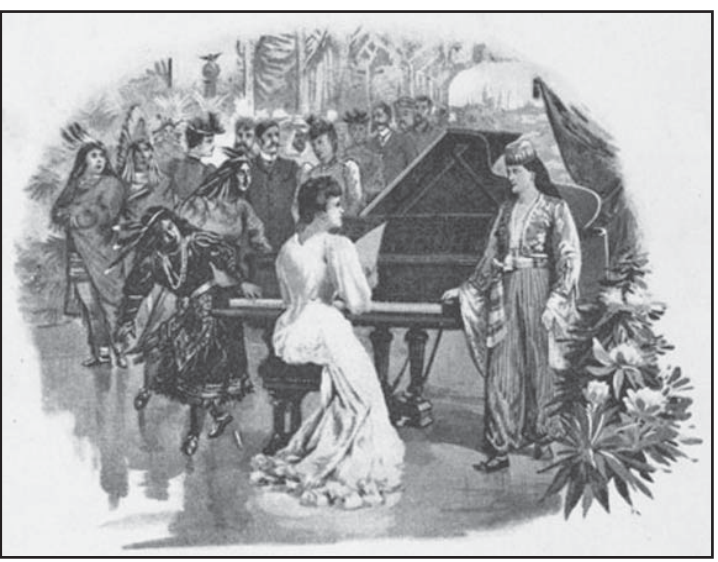
Figure 2. Magazine Advertisement, Sohmer Piano Co., 1892. Sohmer & Co. Records (349) Archives Center, National Museum of American History, Smithsonian Institution

tions between people and musical instruments as well as through the consumption of print culture associated with particular instruments and bodies.3 The metonymic relationship between skin and piano keys makes racialization at the piano more apparent than most other musical instruments; it also led to the everyday use of "ebony and ivory" as racial shorthand. The connection between human player and ivory key is tactile, social, and ideological. It is also aesthetic: one need only point to the current fetishization of the creamy smoothness of ivory keys in our age of cold, hard plastic. Each time a musician sits at an ivory keyboard, she situates herself, consciously or not, in relation to the exotic material she