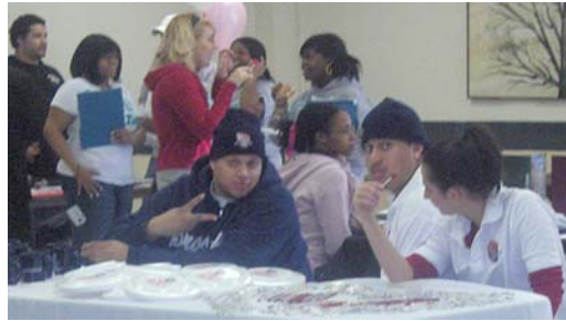
Whether it's an indoor event at the Student Center or an outdoor walk to benefit Breast Cancer research, students are involved in something new everyday at Brooklyn College.

From the early morning hours when the first classes of the day begin to the late evening when the last classes let out, students can always find something to do at BC. Even when the semester ends, everyone will find in Brooklyn College a center for cultural and educational activities they can keep coming back to again and again.