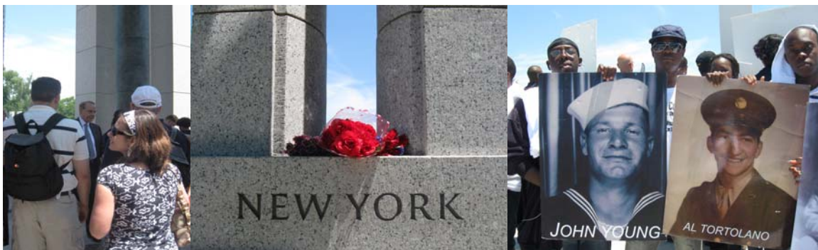
Photo Highlights: Meeting former Senator Bob Dole (a WWII veteran and Brooklyn College alumnus) at the WWII Memorial; Marching under the BC Veterans Affairs banner at the Parade; The cheering crowd of hundreds of well-wishers lining the parade route - An exciting and unforgettable experience for all those who took part.

Now an annual event, The Brooklyn College Office of Veteran Affairs celebrated Memorial Day weekend (May 24-26) with a trip to Washington D.C. Veterans from Brooklyn College and other CUNY colleges, their families, and those who just wanted to share in the patriotic feeling, joined in on this weekend journey. Participants stayed at a hotel in the heart of the nation's capital and took part in sightseeing tours and organized outings in the local area. The culmination of the weekend's festivities for the BC party included a tour of the Washington Mall and monuments and participation in the nationally televised Annual Memorial Day Parade. Holding the photos of U.S. veterans past and present, the BC group marched under the Brooklyn College Veterans Affairs banner. On the ride back home many agreed on one thing – what a great journey it was!