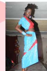
Past fashion shows have included the latest from designers such as Bashy USA Inc, Junior Soft Lines and Carla's Creative Workshop.