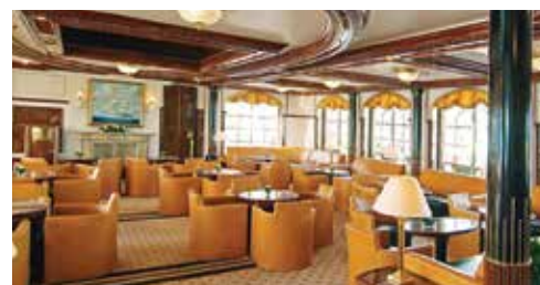
Sea Cloud II lounge

The sailing yacht Sea Cloud II is a three-masted barque steeped in the elegance of yesteryear and complemented with the most modern amenities. Sister ship of the legendary Sea Cloud , Sea Cloud II has 47 outside cabins and travels under 23 billowing sails trimmed by hand. From her mahogany-paneled library and gracious lounge to the fitness area and water sports platform, no detail has been overlooked. Praised by the world's most discerning travelers, Sea Cloud II consistently receives high rankings from Condé Nast Traveler . ■