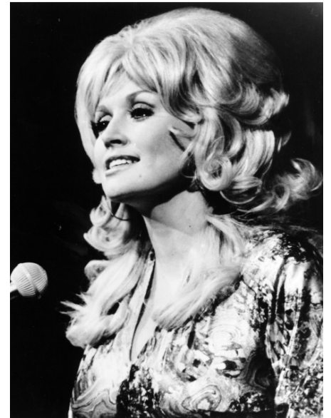
Dolly-Parton, 1975

Following the spirit of inclusivity and diversity that guided the development of AmeriGrove , I followed a few guiding principles as I commissioned and, later, edited entries in my subject area. First, in recognition of the interdisciplinary nature of country music studies, I actively sought to commission articles from scholars working in a variety of fields—from musicology and ethnomusicology to American history, folklore, and journal-