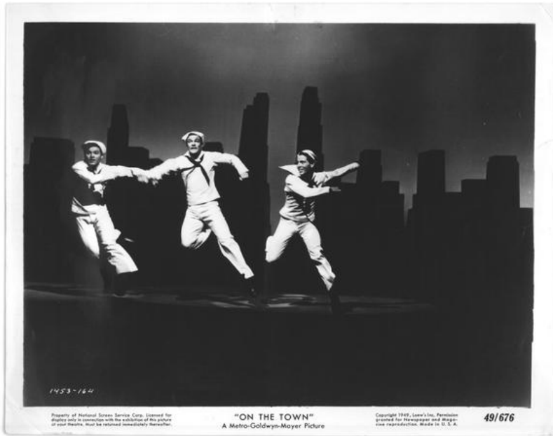
On the Town (1949) Gene Kelly/Stanley Donen