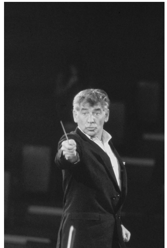
Leonard Bernstein circa 1960

musicals were characterized by their capacity for flexibility, especially in relation to high-low qualities. While Bernstein posed this argument to characterize musical comedy in general, he was also articulating a framework for his own compositional style. In a sense, he was validating the cultural status of an aspect of his artistic life that was disdained by many of his classical-music colleagues. 22