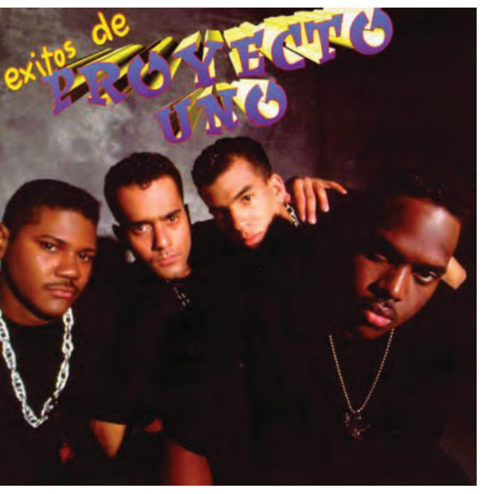
Figure 5: CD cover for Proyecto Uno's Exitos de Proyecto Uno (2007)