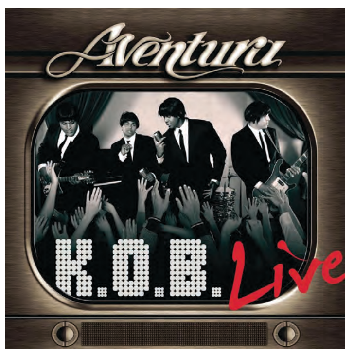
Figure 3: CD cover for Aventura's K.O.B Live (2006). Note the R&B and Beatles influence in Aventura's members' fashion style