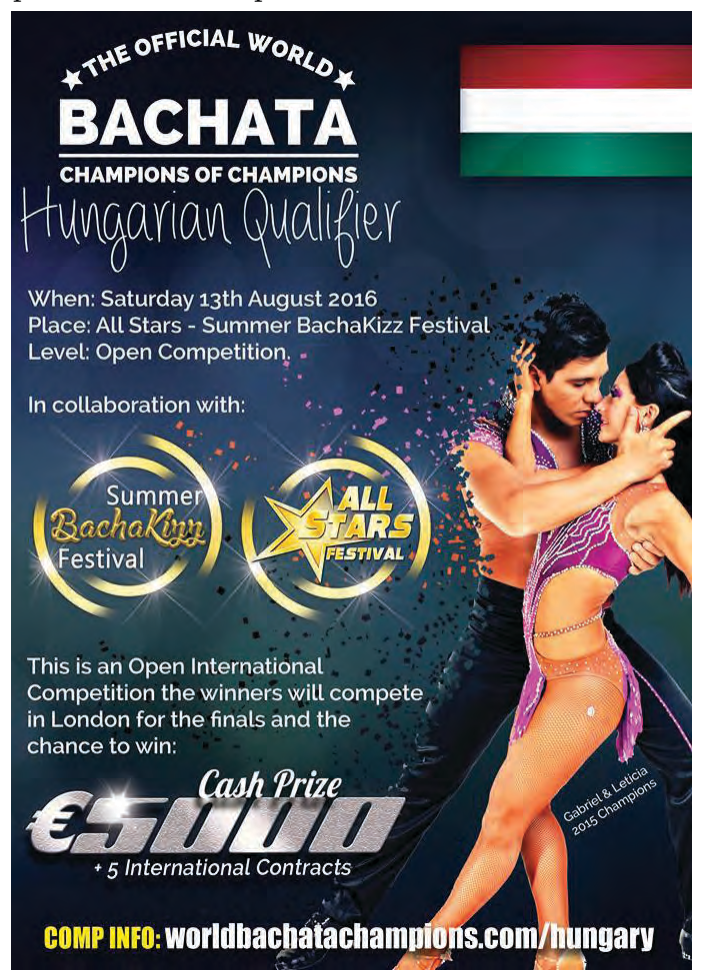
Figure 1: Poster from bachata competition in Hungary

population at 1, 414,703,1 almost half living in New York City.<sup>2</sup> In the last three decades, Dominican migrants and their culture have progressively moved from the margins to the mainstream across multiple industries, from baseball to politics to Hollywood. Dominicans are known for their beauty salons, bodegas, restaurants, and taxi companies, and now for Pulitzer prize winning novelist Junot Díaz, actress Zoe Saldaña (the main character in the 2009 film Avatar), and the recent election of Tom Pérez as the Chair of the Democratic National Committee. Yankee stadium hosts wildly popular merengue nights, which shows not only how established the Dominican