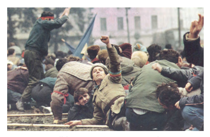
"The Romanian Revolution, 1989"

and of course I didn't." He spent the rest of that year trying to save as much money as he could so that he would be able to immigrate. During tours with the orchestra he took along suitcases of canned food so he could save his per diem. But the gap between the American economy and the fledgling Romanian economy of the 1990s was too great: after a year of effort, he was only able to put aside $700.