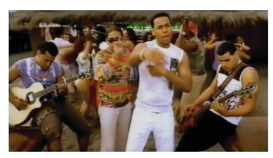
Figure 4: Still photo from Aventura's video for the song "Obsesión" (2002)

As Wendy Roth stated, Dominicans (and Puerto Ricans) have "helped to create a new American racial schema moving their host society away from a dominant binary US schema—which would classify them all as White or Black, based on the one-drop rule—to a Hispanicized US schema that treat White, Black and Latino as mutually exclusive racialized groups."5 These Latinos feel they belong to two countries, which exist in different temporalities, and feel they belong in the liminal space between black and white racial categories in the United States. Groups like Aventura have also expanded the definition of urban music in the United States to include Spanish-language music, which reinforces an identity that is neither black nor white. Because of their use of R&B and hip hop influences and their similarities to African Americans in attitude and fashion styles, they get played in urban radio stations (see figures 2 and 3). However, Aventura's appeal is not just to an "urban" music audience. Their fashion sense, traditional bachata rhythms, and vernacular language also strongly suggest a rural humble Dominican aesthetic (see figure 4).