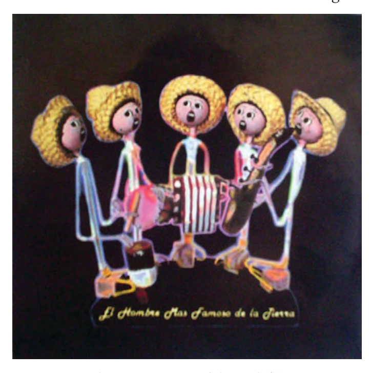
Figure 7: Back cover of Fulanito's CD El Hombre Más Famoso de la Tierra (1997)

Aventura crafted video clips in which they juxtapose references to rural Dominican Republic with New York modern scenes of fancy clubs, drinks, and cars, female models, fashionable attire, and a glamour not accessible by more traditional bachateros. When Aventura became an established group, they collaborated with well-known urban artists such as Nina Sky and reggaetón vocalists Don Omar ("Ella y yo") and Tego Calderón ("Envidia"). In his productions Formula Vol. 1 (2011) and Vol. 2 (2014), Romeo worked with an array of artists, and by his choices we can note his extensive list of both African American, traditional bachatero, and Latino influences. I read these productions as tributes to his multiple influences, but he makes the conscious decision to continue to sing