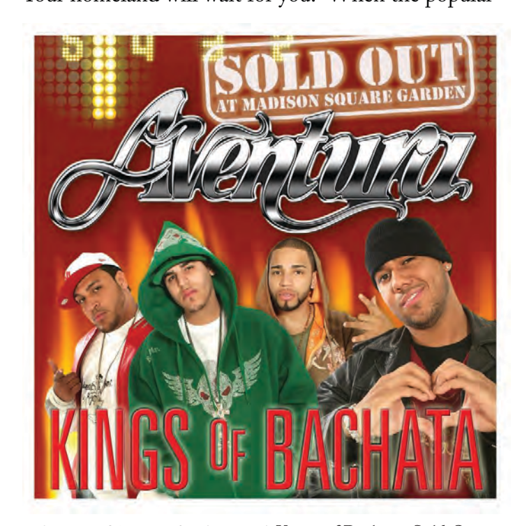
Figure 2: CD cover for Aventura's Kings of Bachata: Sold Out at Madison Square Garden (2007). Note the hip hop fashion

Most Dominican Americans feel primarily Dominican, but they come to also identify as American, Hispanic, and Latino. They grow up speaking Spanish at home, but English in school. Some grow up listening to Black American genres of music such as R&B and hip hop, but most are attached to the bachata and merengue of their parents. Despite a growing identification with African American culture, most migrants from Spanish-speaking countries and their descendants still prefer to identify themselves within mixed and ambiguous categories, such as Hispanic or Latinos, over mutually exclusive ones such as Black.<sup>4</sup>