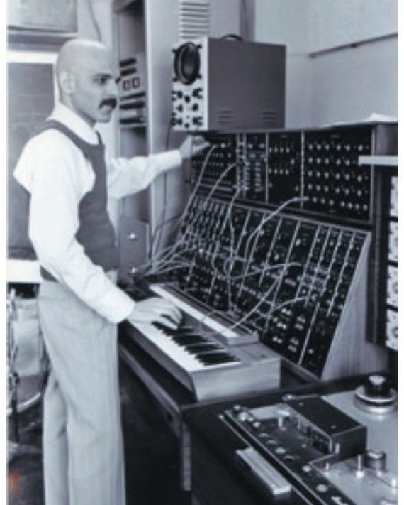
Noah Creshevsky in the 1970s