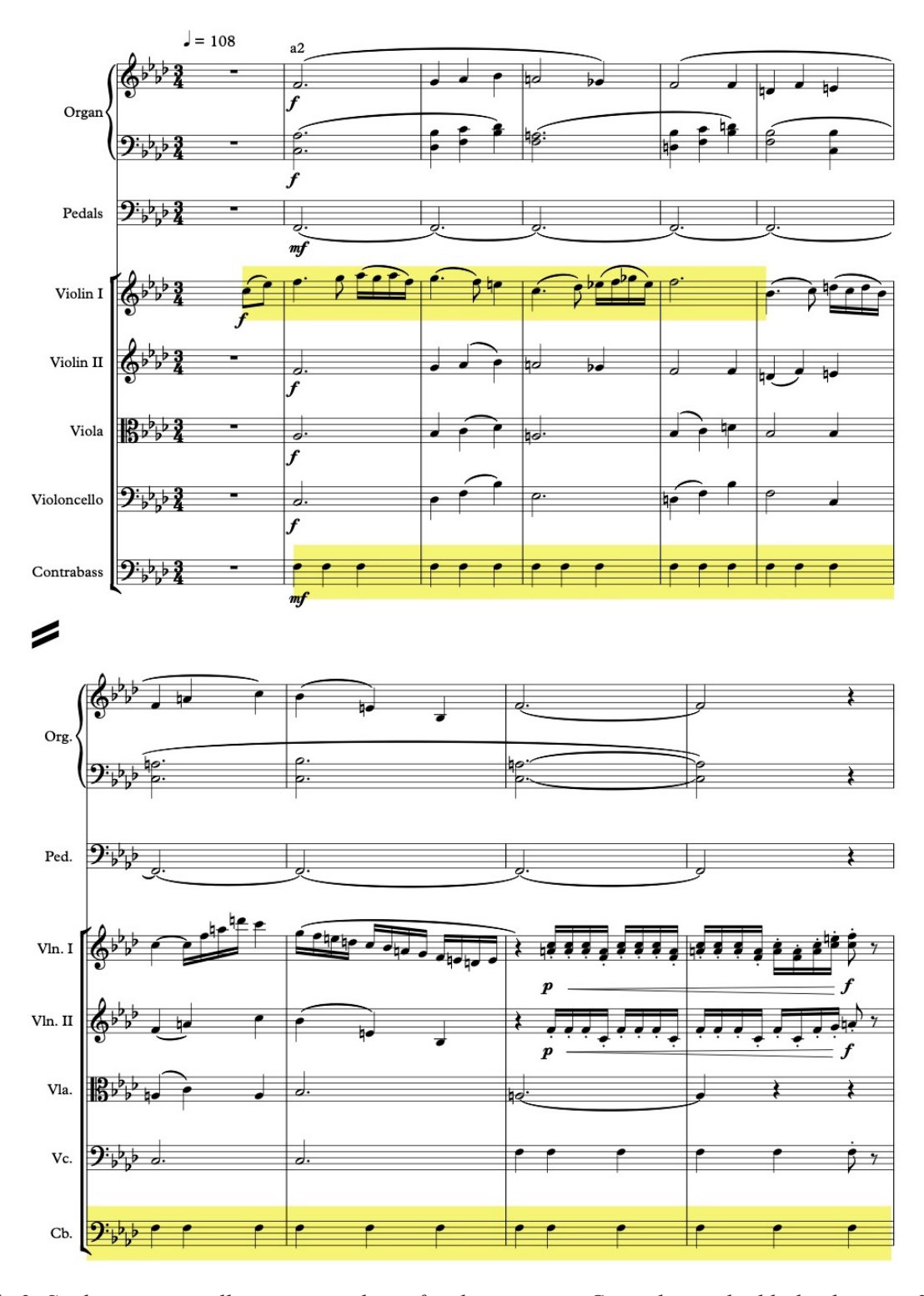
Example 2: Sixth movement allusion to regal motif with ostinato in Contrabasse; highlighted in mm. 248–57

In a sense, the movement takes the listener on a royal tour of the great kingdoms of Africa. The choir and soloist ask at various times about the kingships of Ethiopia, Egypt, and Arabia. Regardless of the ethnicity of Balthazar, the choir proclaims, "I don't know just who he was, but he was a wise man" (Example 3).