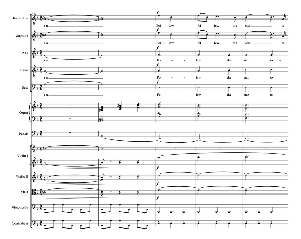
Example 5: D minor climax, "Follow, follow the star tonight," mm. 338–42