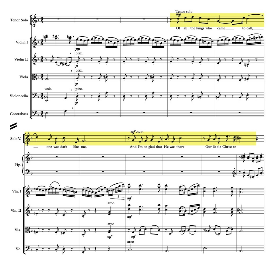
Example 4: "Gretchen am Spinnrade" motif, mm. 319–29; vocal line highlighted