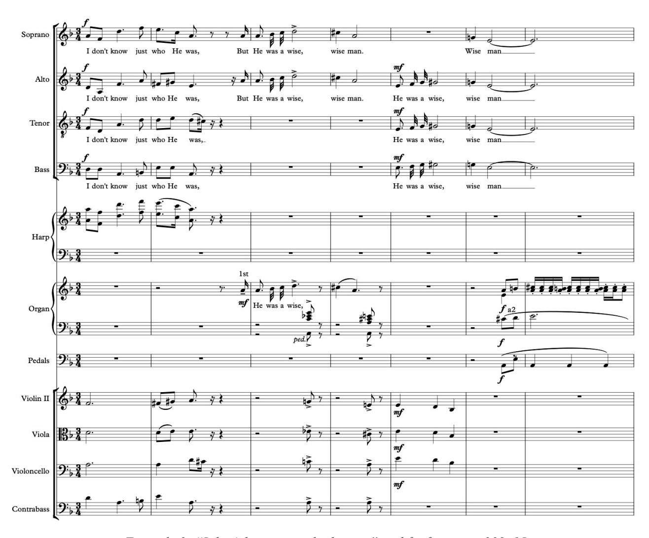
Example 3: "I don't know just who he was" and fanfare, mm. 309–15

The gesture, with its thirty-second—note fanfare, propels the expedition of the King into what some would label a "heart attack moment"—that is, a moment in a piece that completely takes the listener by surprise. Bonds accomplishes this by dropping the dynamic from forte to pianissimo and reducing the texture to strings and tenor soloist (Example 4). The change in disposition, à la Schubert's "Gretchen am Spinnrade," ultimately prepares us for what I believe to be the most important utterance of the piece: