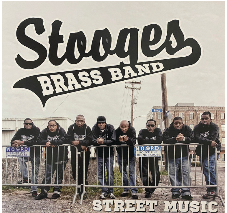
Street Music (2013) album cover