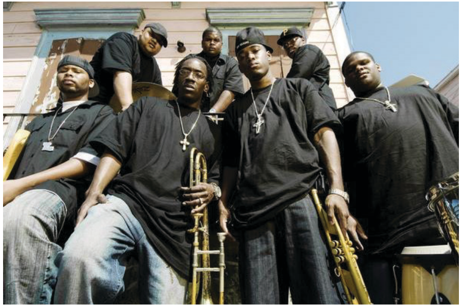
Stooges Brass Band

Fortunately, the Stooges and DeCoste resist the temptation to overly romanticize the brass band experience. The endless labor needed to eke out a living as a musician is a frequent theme. They recount a typical Saturday when the band spends hours in the heat of a second line parade, then runs to several “black and white” wedding gigs, and completes the day with one or more evening club appearances. With many members now in or approaching their forties, the intense physicality of the job has begun to take its toll, as described in chapters devoted to the toil of working the local club circuit and the grind of summer touring in old vans prone to late night Interstate breakdowns.